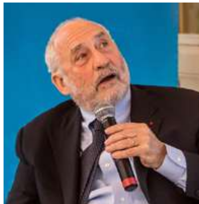
Joseph Stiglitz, Nobel Prize Winner in Economics