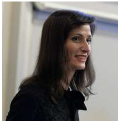
Mariya Gabriel, European Commissioner for Innovation, Research, Culture, Education and Youth