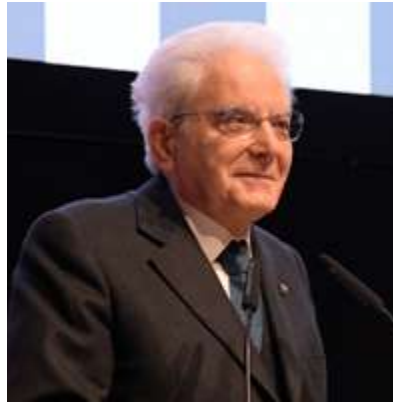
Sergio Mattarella, President of the Italian Republic