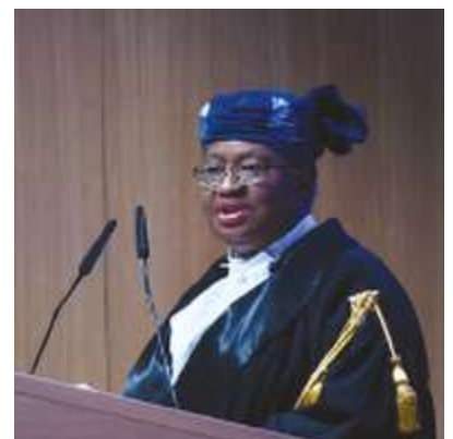
Ngozi Ikonjo-Iweala, Director General of the World Trade Organization