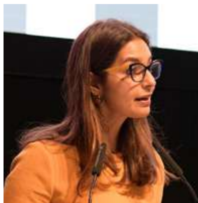
Jhumpa Lahiri, Pulitzer Prize Winner