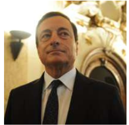
Mario Draghi, President of the Council of Ministers of the Italian Republic