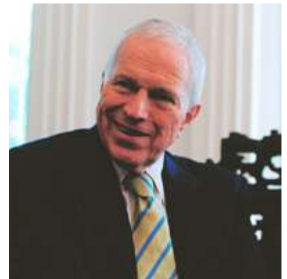
Edmund Phelps, Nobel Prize Winner in Economics