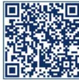
International Student Service System