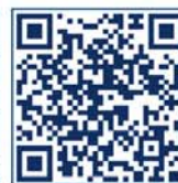
Twitter Chongqing University