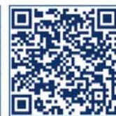
WeChat official account 留学重大StudyAtCQU