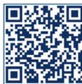
Facebook Chongqing University