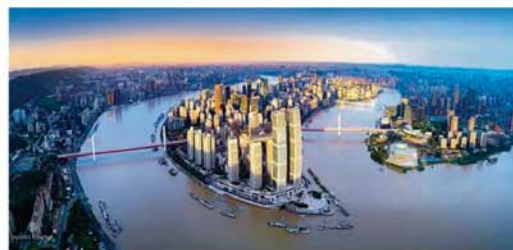
Intersection of the Yangtze River and Jialing River