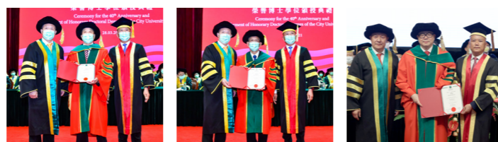
澳門城市大學四十周年校慶晚宴 Anniversary Gala Dinner of the City University of Macau