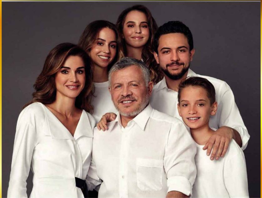
His Majesty King Abdullah II bin Al-Hussain And the Hashemite Royal Family