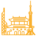
China: Tradition and Modernity

CUHK aims to consolidate its position as a centre of excellence for cutting-edge, interdisciplinary research with a global impact and seeks to optimise opportunities and make significant contributions to society by translating research findings into practical applications. We currently have four research foci, which are of critical importance to the flourishing of humanity in the 21st century: