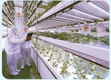
The 1 st university-owned LED plant factory LED Agriculture & Life Science Convergence Technology Research Center