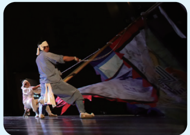
The first non-governmental organization selected as cultural heritage by UNESCO among academic institutions in Korea The Center for Intangible Culture Studies