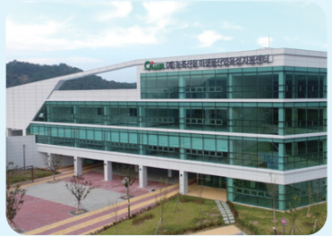
Center for Industrialization of Agricultural and Livestock Microorganisms