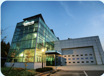
Aeronautics Engineering LANL*-JBNU Engineering Institute Korea *Los Alamos National Laboratory