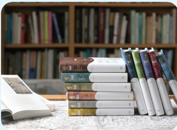
Publication of the "Science and Civilization in Korea series" in cooperation with Cambridge University The Korean Research Institute of Science, Technology and Civilization