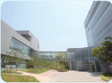
Top in Asia Korea Zoonosis Research Institute