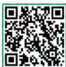
Online Admission System

Application for PGS is optional. An applicant for full-time studies who wishes to apply for the award shall indicate in the application form.